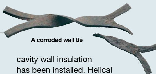
A corroded wall tie

Mechanical expander remedial ties are threaded bars with sleeves, pushed through pre-drilled holes. Once turned, the bars expand their sleeves, ensuring fixity. Best used when the masonry is in good condition. Resin or grouted ties are anchored into place when their resin (or grout) sets – not suitable when